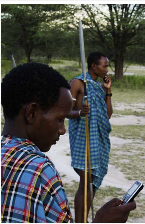
Trends in Ecology & Evolution

The challenge is making technology accessible. In the hands of all stakeholders, even basic smartphones provide a wide range of conservation-relevant data. Rural communities can record incidents of human-wildlife conflict, monitor habitat, or anonymously report intelligence information to authorities. Broader participation would increase the volume of data collected and afford opportunities to engage local communities, thus resulting in long-term conservation success [84].